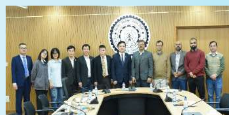
7-member delegation from Vietnam National University, Hanoi - December 24, 2025