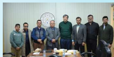
3-member delegation from Tribhuvan University Nepal – December 4, 2025