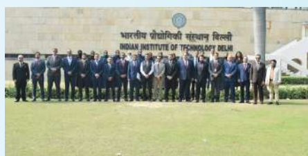
29-member delegation from Qatar – November 10, 2025