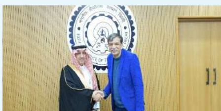
H.E. Yousef Bin Abdullah Al-Benyan, Hon'ble Minister of Education, Kingdom of Saudi Arabia - December 9, 2025