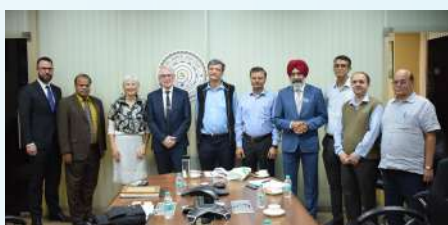
4-member delegation from University of Saskatchewan, Canada - November 3, 2025