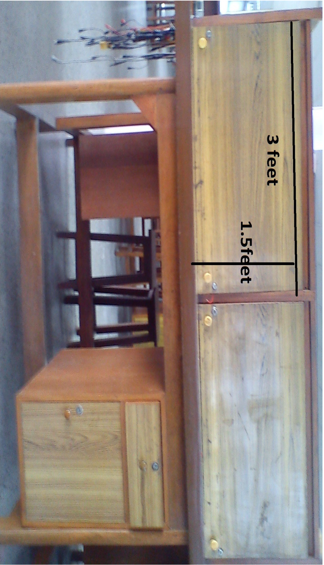
Existing working table with shutter closed