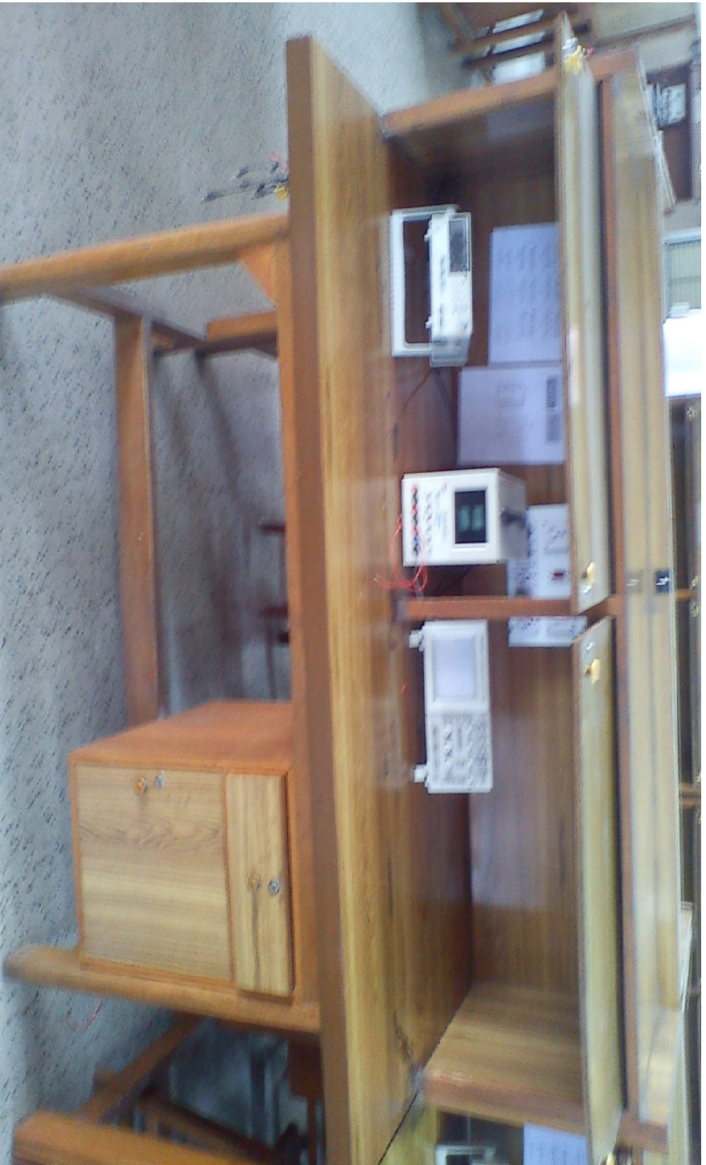
Existing working table with shutter open